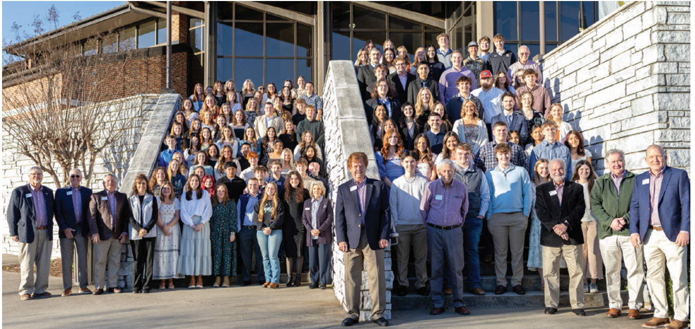
$146,000 in scholarships was awarded to high school students across the Amicalola EMC service area. Pictured are the 2026 scholarship recipients with the Amicalola Electric Membership Corp. Board of Directors.

O n March 17, more than 350 people gathered at Chattahoochee Technical College in Jasper to celebrate the achievements of local students from across the service area. The annual event brought together students, parents, school representatives and members of the Amicalola EMC Board of Directors and staff for an evening dedicated to recognizing academic success and leadership.